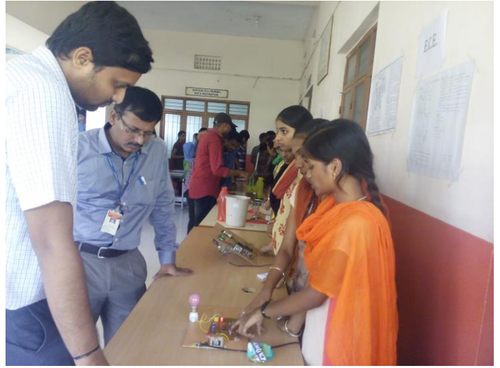
Circuit Bug Identification: